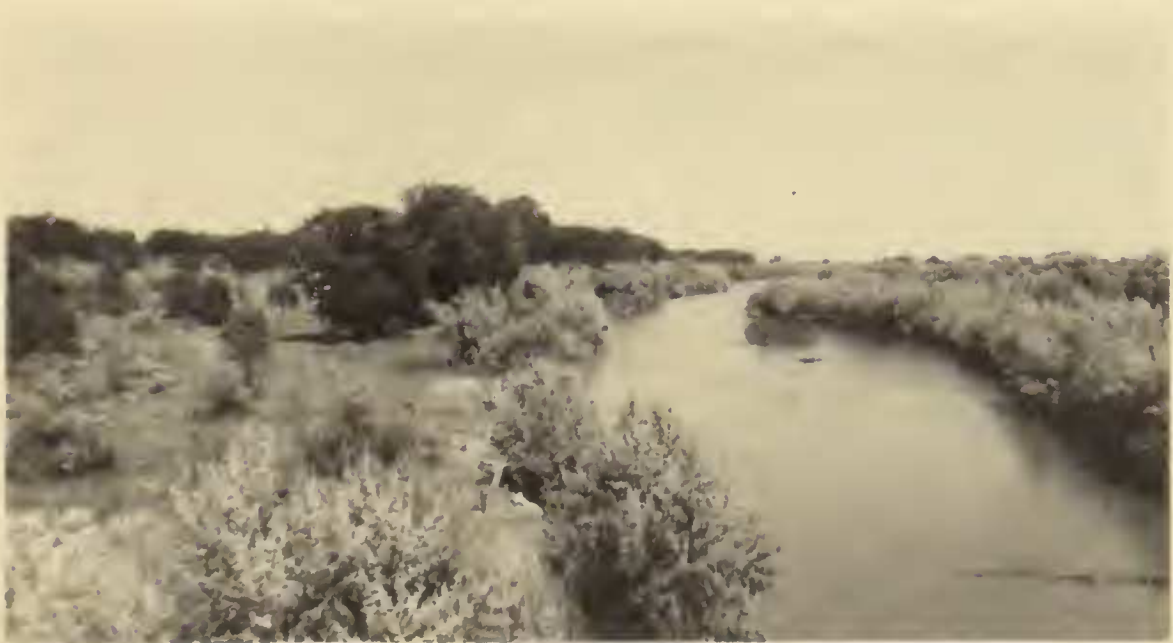
FIG. 12.—Canadian River north of Canadian, Hemphill County.

survey maps or on those in the publication County Maps of Texas , issued in 1987 by the Texas Department of Highways and Public Transportation. In several cases, recourse to accounts of county or regional histories was necessary to locate older names. To the best of our knowledge, we listed only specimens from north of the Canadian in those counties bisected by the river. In two cases, this calls for further explanation. Currently, Tascosa is